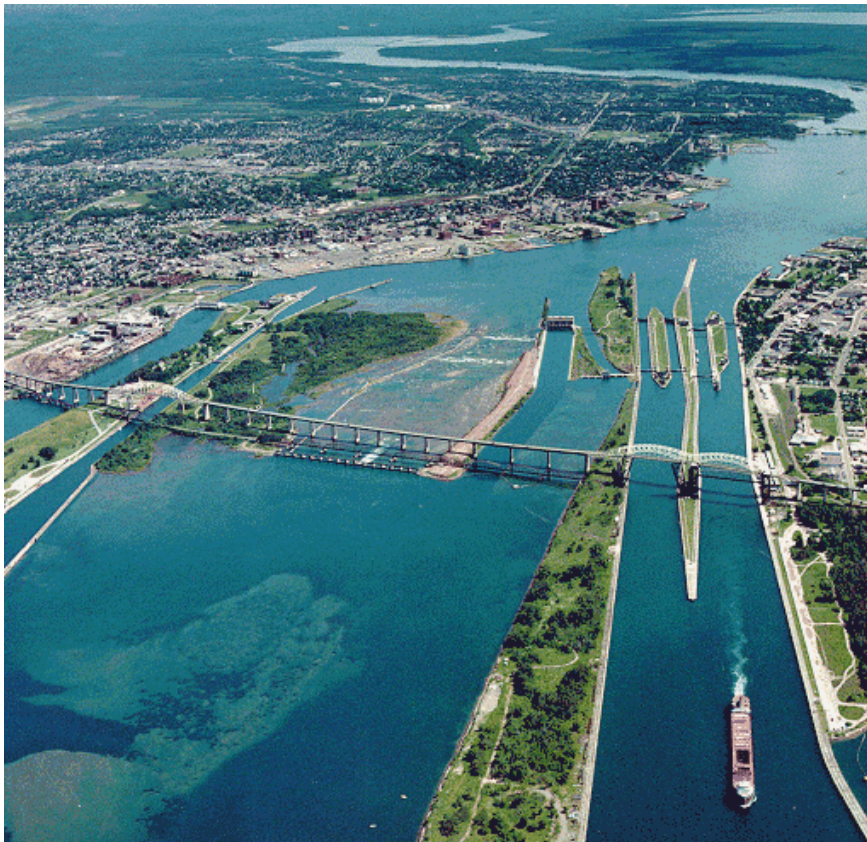
Aerial View of the Soo Locks on the St. Mary's River. Canada, to the left, the U.S. to the right.

TBD – Vans and cars back to Kewadin hotel